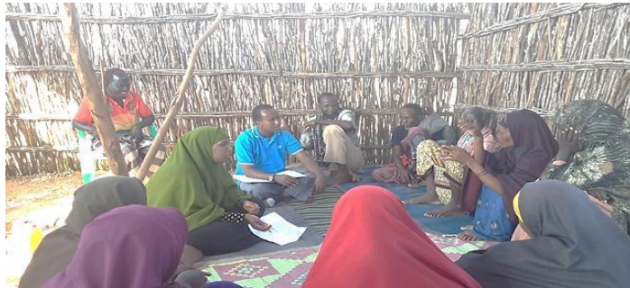
Community Focus group discussions in Baidoa