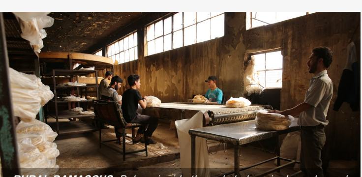
RURAL DAMASCUS: Bakers inside the only bakery in Jayrud supply of bags of bread per day to the residents of the town and nearby villages.

CRISIS BACKGROUND: The crisis in the Syrian Arab Republic that started in March 2011 has transformed into a complex emergency that has displaced around 6.3 million people and forced around 4.8 million people out of the country to seek asylum. As per the 2017 Humanitarian Needs Overview, around 13.5 million people are in need of humanitarian assistance of which around 4.3 million people are desperate to receive adequate shelter support and other multi-sectorial assistance as they continue to struggle in an unsafe and uncertain environment. Due to the protracted nature of the hostilities, many of both displaced and host communities become more vulnerable and their ability to cope and find safe and durable shelter solutions have been greatly affected. The humanitarian community has been challenged to both provide emergency and life-saving shelter solutions while building back community cohesion and resilience through provision of sustainable shelter assistance.