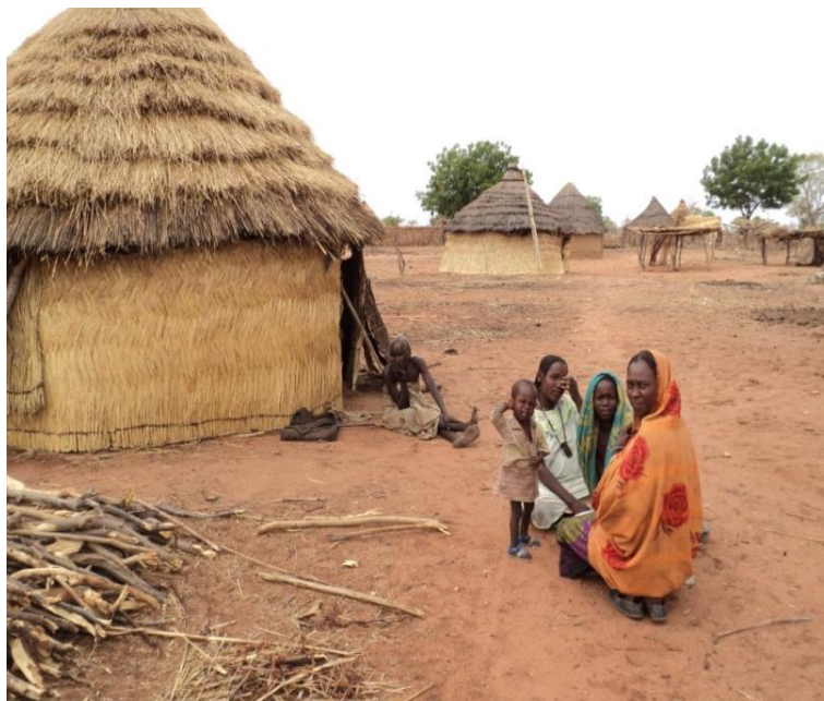
The pictures above show examples of environmentally friendly shelters provided by INTERSOS