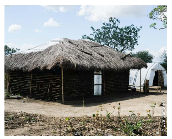
Emergency Shelter and Semi-Permanent Shelter (self-built) as part of the upgrade strategy within the same household, Ntokota Relocation Site, Metuge, Cabo Delgado.