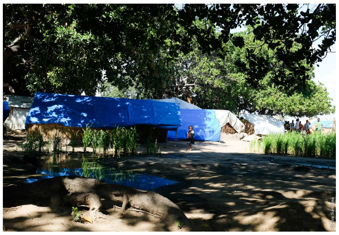
During 2020, the conflict in the north of the country expanded and displacement increased rapidly. Many displaced people moved to temporary sites, such as this one in Cabo Delgado.