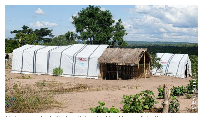
Shelter extension in Ntokota Relocation Site, Metuge, Cabo Delgado.

One key aspect of HLP in Mozambique is that community land rights through occupancy are often not formally registered and are thus "invisible" in formal records and official maps. Parallel informal property systems exist in periurban and rural settlements. In this context, conducting "due diligence" processes to understand the tenure of land for humanitarian interventions (such as shelter and the construction of infrastructure) is very important. The Cluster actively trained partners on approaches to addressing and conducting due diligence on land ownership.