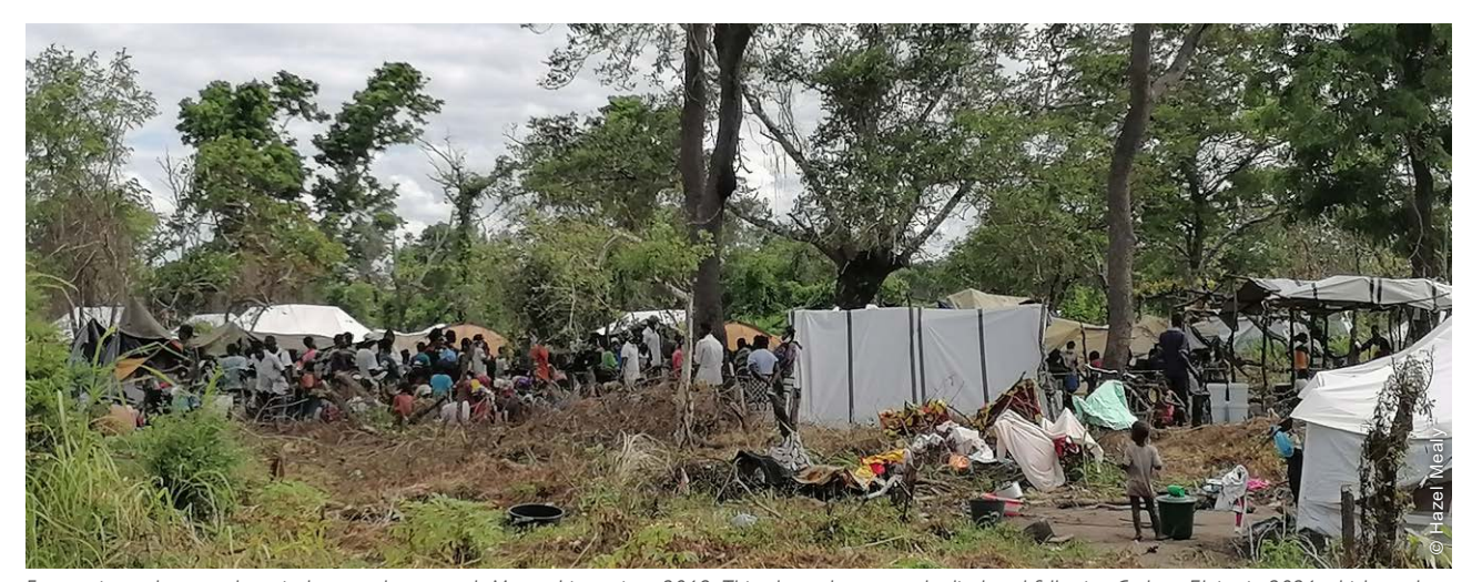
Four major cyclones and tropical storms have struck Mozambique since 2019. This photo shows people displaced following Cyclone Eloise in 2021 which made landfall close to where Cyclone Idai had struck in 2019.

On top of the conflict, on the 30<sup>th</sup> December 2020, Tropical Storm Chalane struck in the Central Region of Mozambique. It hit locations where approximately 90,000 displaced people from Cyclone Idai were living in resettlement sites. Overall the storm affected 86,412 families (441,686 people). The most vulnerable people, who were unable to prepare/upgrade their shelter ahead the storm, were the most affected. Tropical Cyclone Eloise then struck on 23<sup>rd</sup> January 2021. It affected an area to the south of the conflict, making landfall near where the 2019 Cyclone Idai had struck. It landed as a Category 2 Tropical Cyclone.