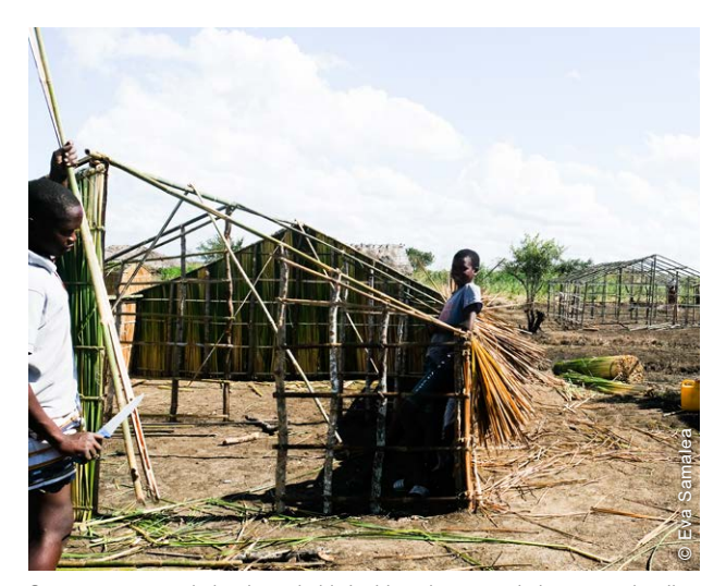
Support was provided to households building their own shelters using locally available materials. This included trainings and awareness raising on more resilient construction techniques, and on mitigation of the potential negative environmental impacts of shelter construction.

Beyond the basic ES/NFI kits and construction tools that were provided, supporting organizations also provided trainings. Awareness on proper use of natural resources and technical guidance for building more resilient shelters was aimed at increasing effectiveness of the response, and mitigating the environmental impacts related to emergency shelters interventions (such as deforestation and soil degradation).