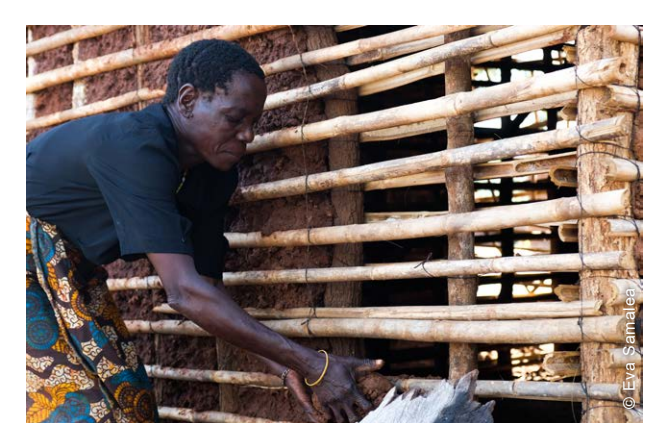
Woman building her shelter, Meculane, Chiure, Cabo Delgado.