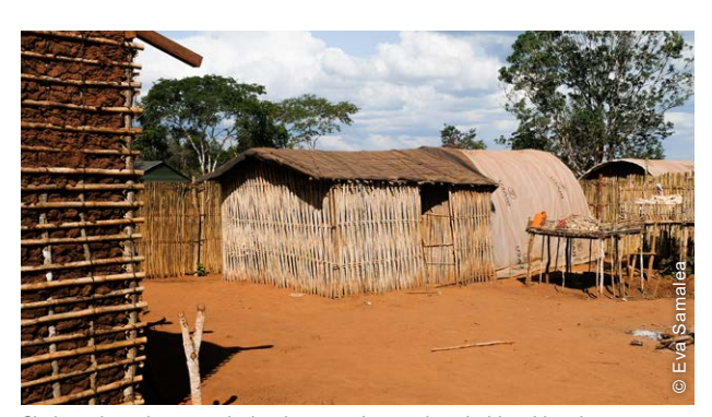
Shelter phased approach development by one houshold in Meculane Relocation Site, Chiure, Cabo Delgado.