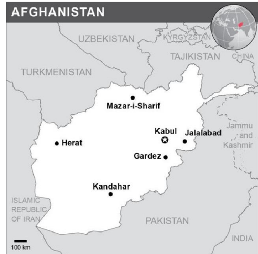
The boundaries and names shown and the designations used on this map do not imply official endorsement or acceptance by the United Nations. Creation date: 10 May 2016.