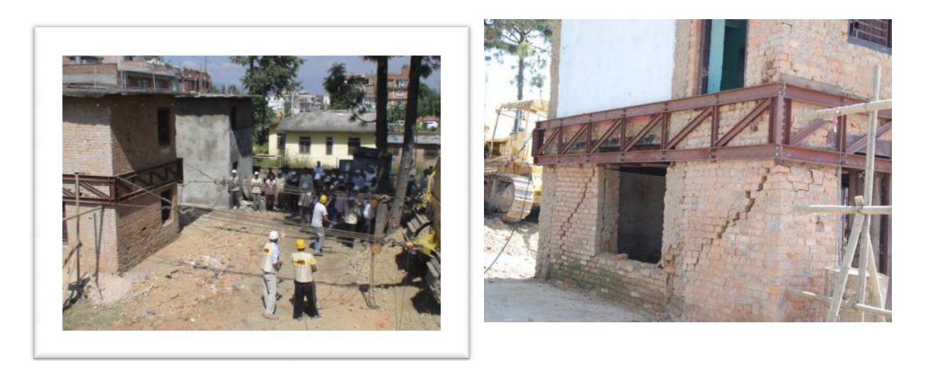
Fig 3.2 Loading arrangement (left) and crack propagation (right) during pull down test of non-retrofitted building