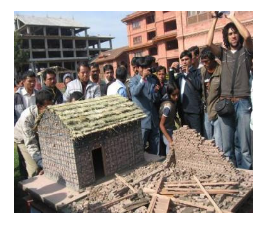
Fig 3.7 Shake table result' Non-retrofitted building collapse while retrofitted building is standing