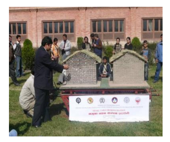
Fig 3.6 Two identical buildings with and without retrofitting by PP Band before shake table

In order to demonstrate the seismic response of the target building, with and without PP-band mesh retrofitting, and to compare crack patterns, failure behavior, and overall effectiveness of the retrofitting technique, a shake table test was carried out. The test verified that PP-band mesh retrofitting significantly improves the performance of the masonry building structures, maintaining the structural integrity with sufficient energy dissipation through extensively developed cracks [NSET, June 2009]. The general process of retrofitting by PP Bands includes 1) Plan modifications such as adding or removing solid walls, changing door/window openings, if required, to balance wall stiffness in both directions 2) Chipping off the wall plaster 3) Fixing of base anchor beam and tying on either side of the wall 4) Fixing of vertical PP Band starting from the outer anchor beam and ending at the inner anchor beam (this is feasible with flexible timber flooring) 5) concreting of anchor beam 6) Meshing the horizontal PP band on vertical PP band then connecting horizontal PP-Band with vertical PP-Band by Welder 7) Connecting inner and outer mesh with wires and aluminum plates 8) connecting roof elements with wall and bracing of roof 9) Mud plaster on wall to protect PP Band from ultraviolet rays.