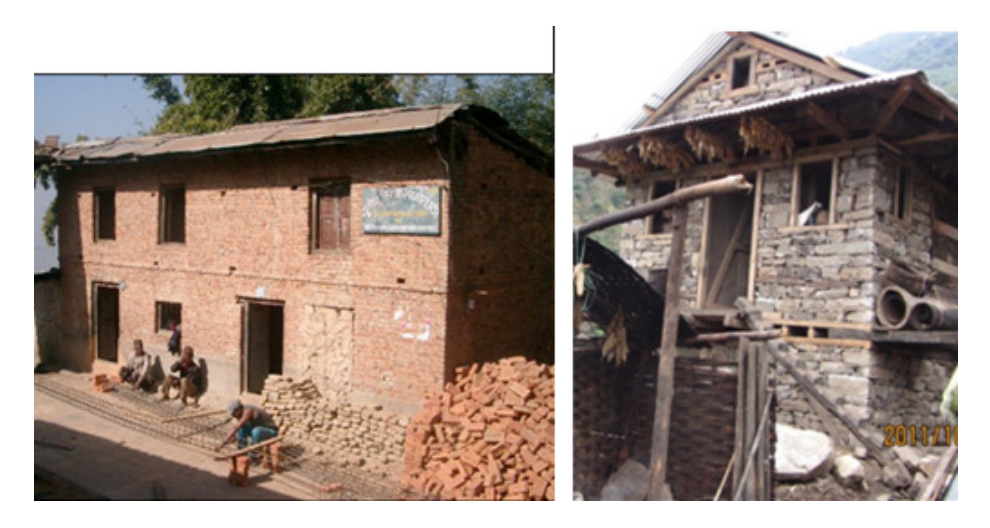
Fig 1.1Typical brick (left) and stone (right) masonry buildings in Nepal