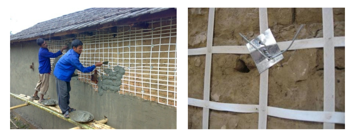
Fig 3.5 Implementation of PP band method of retrofitting in Kathmandu Valley (left) and anchorage throughout the wall (right)

A pilot scheme implementing the PP-Band technology in Nepal was conducted in a rural village just outside Bhaktapur, in Nepal, by National Society for Earthquake Technology-Nepal (NSET) in collaboration with Mondialogo Engineering Award Team. The project is titled 'Improving the Structural Strength under Seismic Loading of Non- Engineered Buildings in the Himalayan Region' and outlines training courses for rural masons and public demonstrations for community members in the seismically active Himalayan region, to promote seismic resistant building and retrofitting techniques, focusing on polypropylene meshing. The main objective of the project is to disseminate and transfer the PP-band retrofitting technique to the communities who cannot afford other expensive retrofitting technology. The masons were trained through hands on implementation, found to be technically feasible and easily implemented.