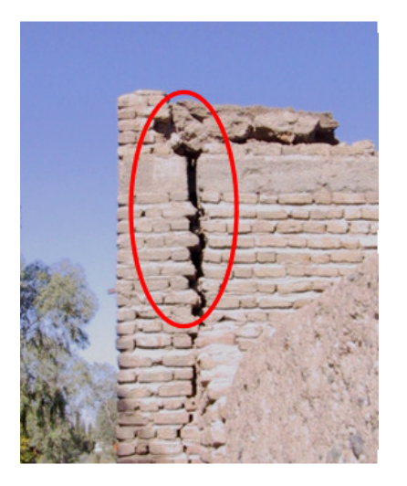
Fig 2.1 Diagonal shear failure, (left); Corner separation due to lack of integrity (right), 2005 Pakistan earthquake, Photo courtesy NSET