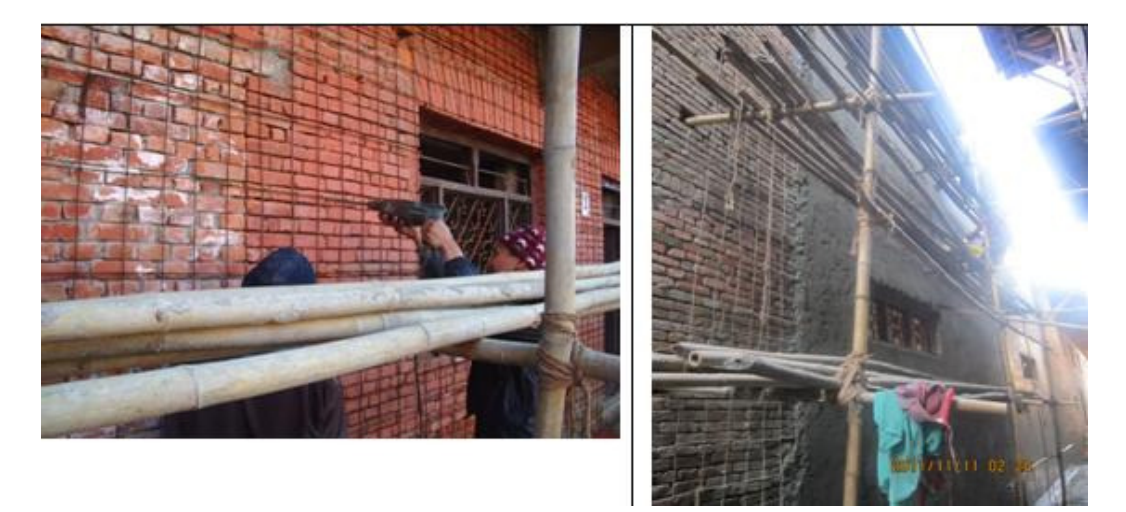
Fig 3.1Retrofitting process using steel wire mesh

includes 1) Removal of plaster from walls in the proposed area for RC jacketing and Bandage/Splint 2) Rake out mortar joints to 15-25 mm depth, clean surfaces and wet with water 3) Excavate the soil for tie beam and lay the reinforcement of tie beam and wall 4) Drill in the wall and provide anchor rod to tie inner and outer steel reinforcement 5) Cast tie beam and apply concrete/plaster in two layers 6) Cure concrete.