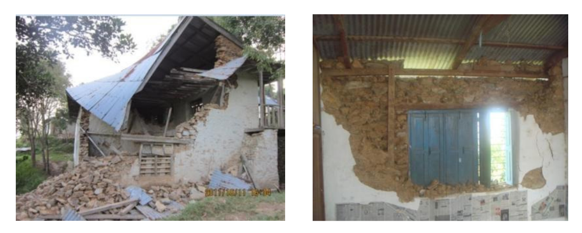
Fig 2.2 Failure of roof connection to wall (left); Collapse of inner wythe of stone wall due to lack of through stone (right), 18th Sept 2011Taplejung Nepal earthquake, Photo courtesy NSET