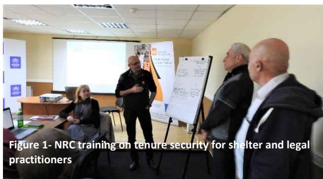
Figure 1- NRC training on tenure security for shelter and legal practitioners