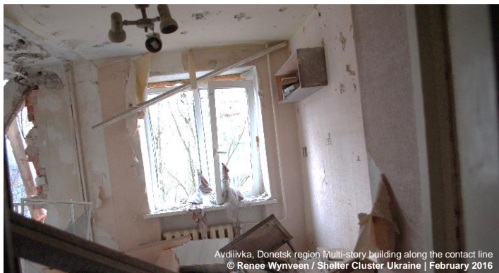
Avdiivka, Donetsk region / Multi-story building along the contact line © Renee Wynveen / Shelter Cluster Ukraine | February 2016