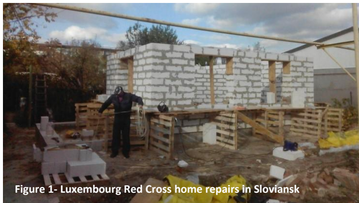
Figure 1- Luxembourg Red Cross home repairs in Sloviansk