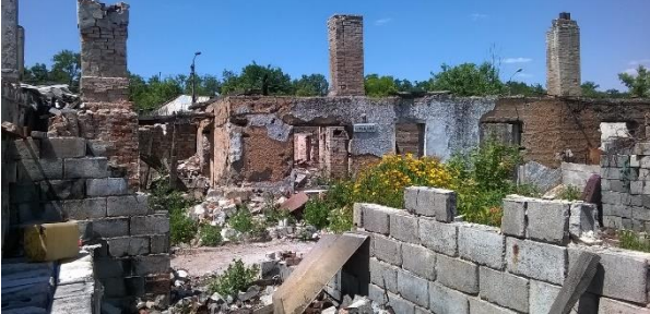
Figure 1-Category 4 damaged homes along contact where vulnerable and elderly still reside as they have no other housing solutions.