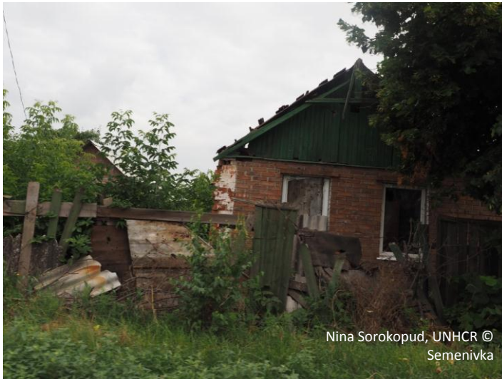
Nina Sorokopud, UNHCR © Semenivka