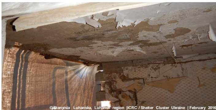
©Stanysia Luhanska, Luhansk region |ICRC / Shelter Cluster Ukraine | February 2016