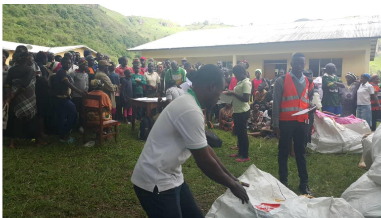
NFI Kits Distribution Babanki.NW Region: ©NRC 2019