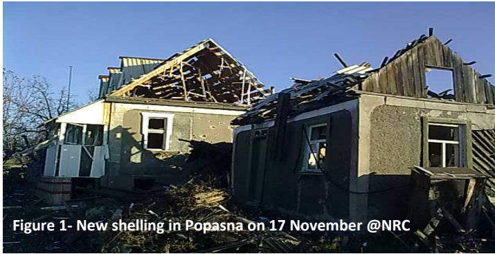
Figure 1- New shelling in Popasna on 17 November

• Training National Ministry on Damage Database- On 1 November 2017, the Shelter/NFI Cluster team provided a training to 10 focal points for the Ministry of Temporarily Occupied Territories on the damage database. This training provided reinforcement to national focal points and to further relationships that have been formed at local level. In the next few months, it is foreseen, that the Shelter/NFI Cluster will continue such trainings at local level and also at national level to ensure that the interactive portal becomes operational and that local authorities can also find a quick and interactive way to communicate their shelter needs to both local and national levels.