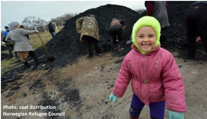
coal distribution Norwegian Refugee Council