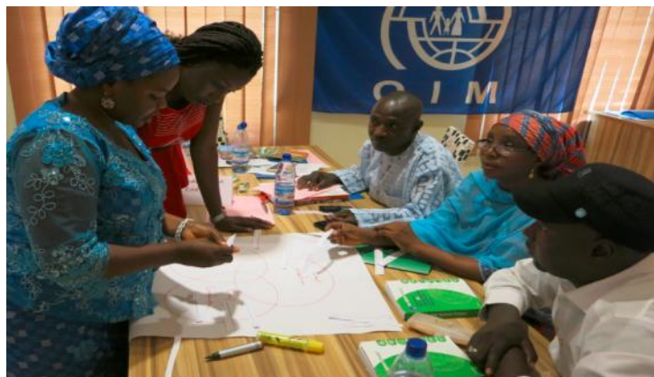
CCCM Training in Yola

NEMA, ADSEMA, Nigerian Red Cross and IOM site facilitators. The training covered roles and responsibilities in CCCM, minimum standards, participatory approach, information management and coordination as well as protection. Participants were very engaged as the training was interactive and largely focused on practical activities and the sharing of experiences across different camps. A detonation at the police