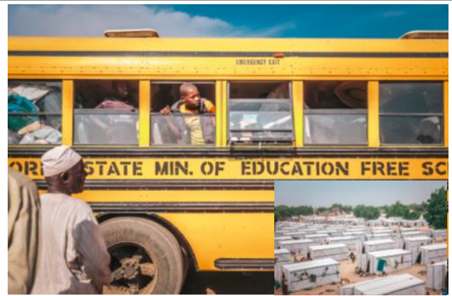
Relocation of IDPs from schools Bakassi camp

The next institution targeted will be the Arabic Teachers College.