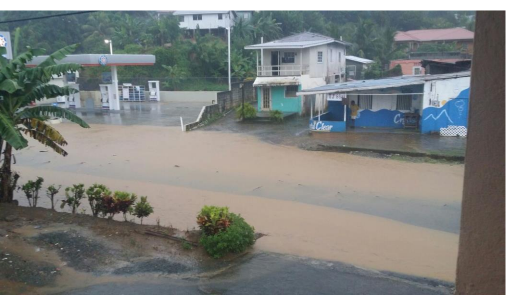
Flooding in Bexon, St. Lucia.