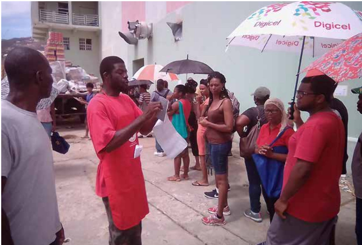
Demonstration of purpose of reinforced strip at tarpaulin distribution. Photo: David Dalgado, British Virgin Islands, 2017