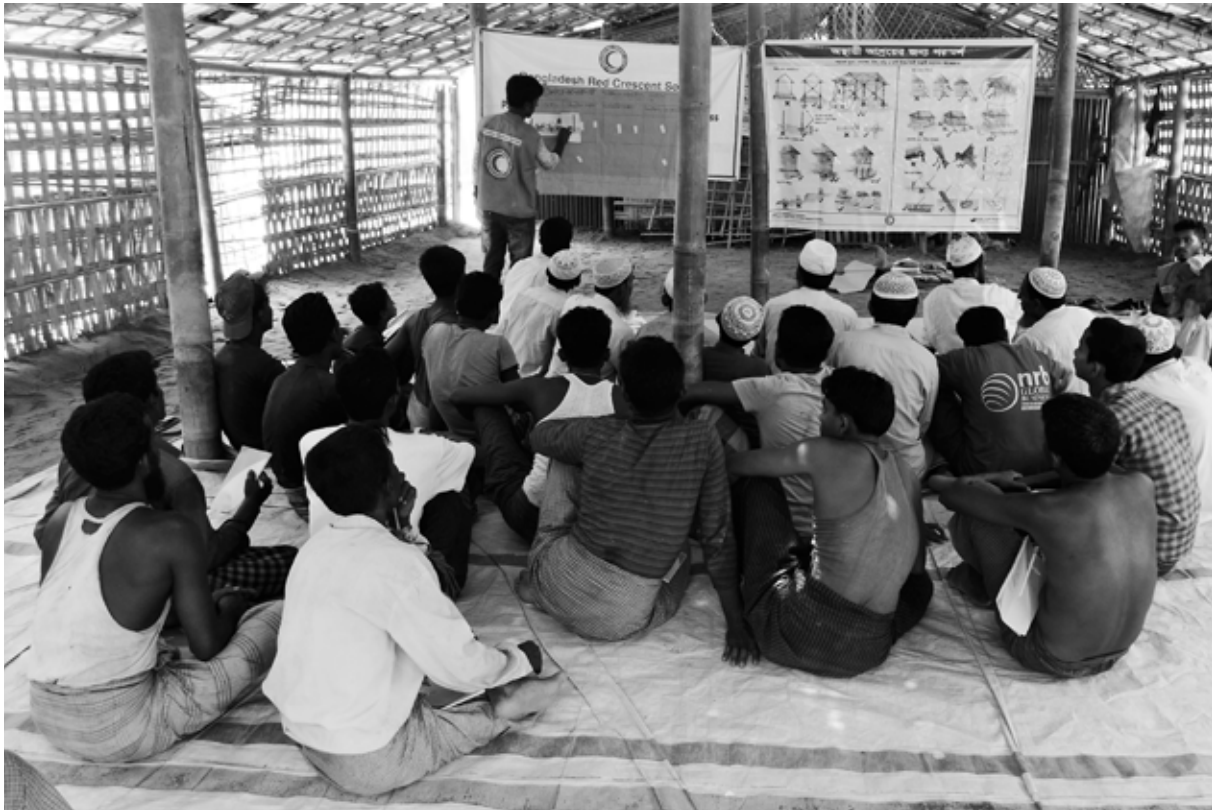
Bangladesh, 2018