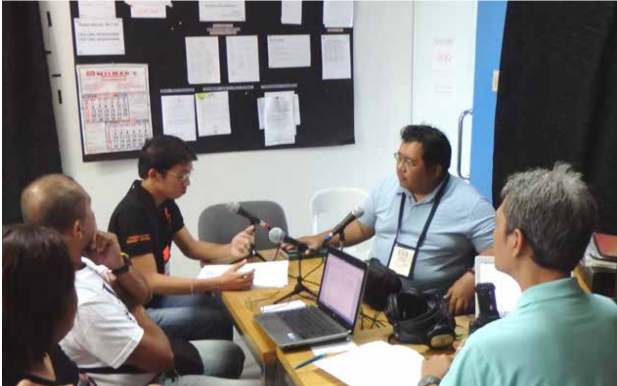
Typhoon Haiyan Build Back Safer talk radio show with call ins.