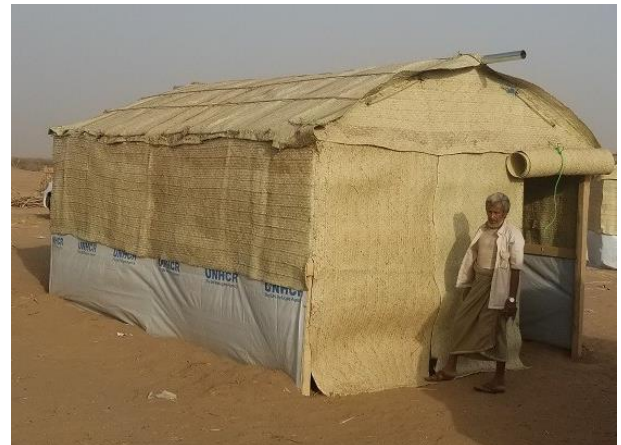
An IDP receiving new Tehamah Emergency Shelter Kit that is being piloted by UNHCR in Hajjah Governorate.