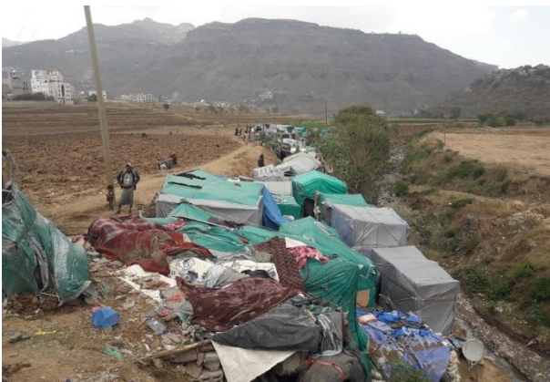
Photo of an IDP hosting site in Ibb Governorate shows the situation of IDPs in hosting sites who are in dire need for multi-sectorial assistance.

Reports indicate that the new displacement in Ibb Governorate has further increased rental prices in the Governorate while there are shortage of resources, affecting both IDPs and host community. Many displaced families were reported to be living with friends or family, others are staying in public buildings, makeshift structures, or out in the open.