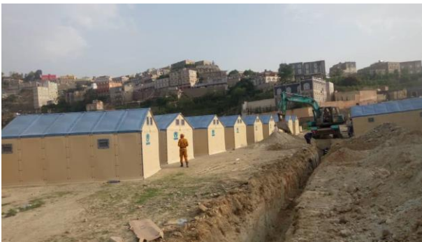
Refugee Housing Units (RHU) being erected by UNHCR through JAAHD (Jeel Albena Association for Humanitarian and Development) in Hajjah City.

Fighting continued in Abs district especially along the coastal areas resulting in displacement of families. Sporadic armed clashes and airstrikes reported mainly in Al Hudaydah City, Ad Durayhimi and At Tuhayat districts. Around 2,000 families were found to be in need for NFI kits in Al Hudaydah City and the Sub-National Cluster (SNC) is mobilizing Partners to provide the response.