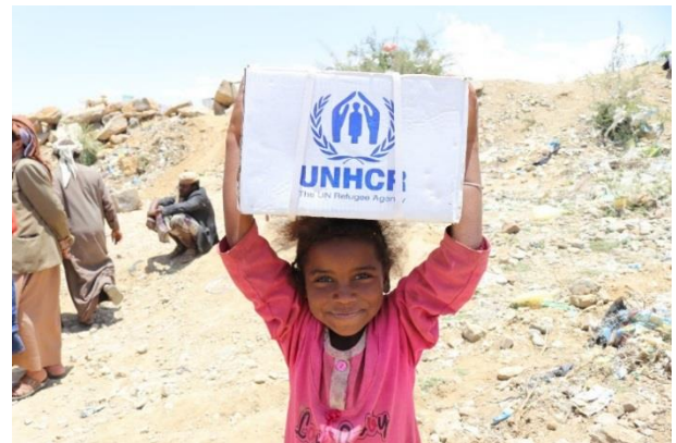
An IDP child carrying Non-Food Items provided by UNHCR in Madhlouma IDP hosting site in Huth district of Amran Governorate.

Shortage of NFI supplies affecting 7,000 families in Amant Al Asimah and Sana'a Governorates who have been assessed by Cluster Partners and found to be in critical need for assistance.