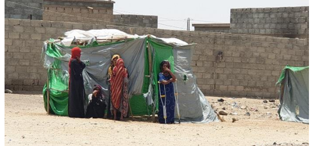
IDP women found to be in very dire situation and require urgent humanitarian assistance in an IDP hosting site in Abs district of Hajjah Governorate.

and NAMCHA representation in Hajjah to discuss the ongoing response, challenges and gaps, SMC partners were mentored on the site profiling tool and ActivityInfo reporting, presence and functionality of SMC structure at site level were evaluated and the necessary guidance and technical support was provided to Partners.