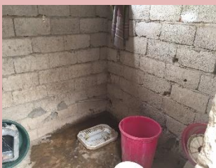
Mission to Aden: Toilet cum shower lacking door, lock, light bulb, privacy and tiling.

A full mission report has been shared and uploaded on the Cluster webpage at http://sheltercluster.org/response/yemen .