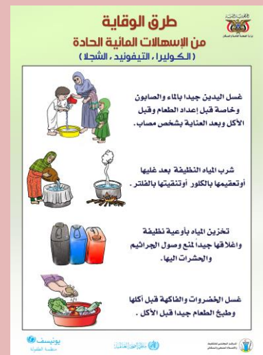
Cholera prevention: Approved IEC Material