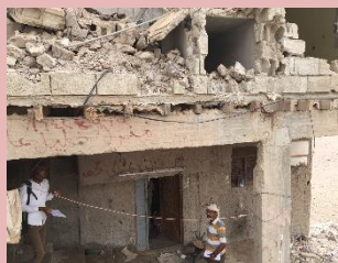
Mission to Aden: Evidence of destruction