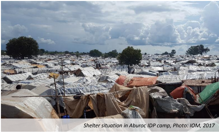
Shelter situation in Aburoc IDP camp, Photo: IOM, 2017