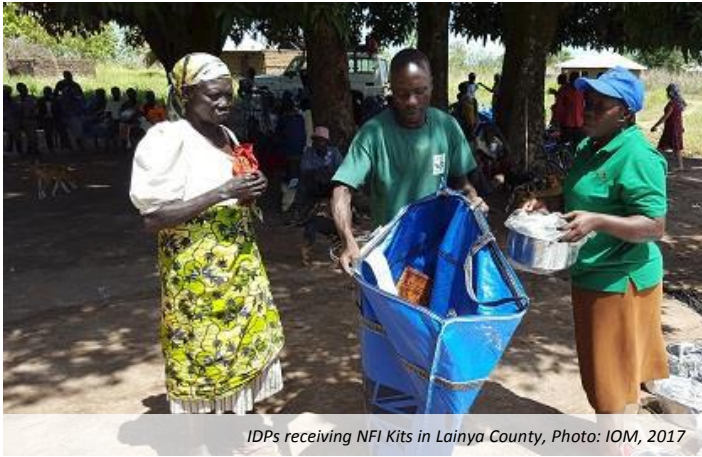
IDPs receiving NFI Kits in Lainya County, Photo: IOM, 2017