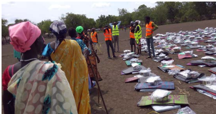
Vulnerable woman group given priority during the NFI distribution in Akobo.