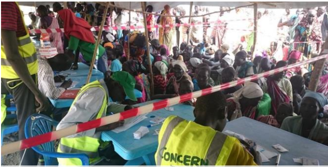
Newly arrived IDPs await shelter registration in Bentiu PoC.