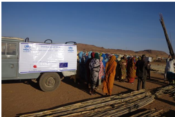
IDPs from Jebel Mara in Tawilla North Darfur receiving emergency shelter material from sector partner