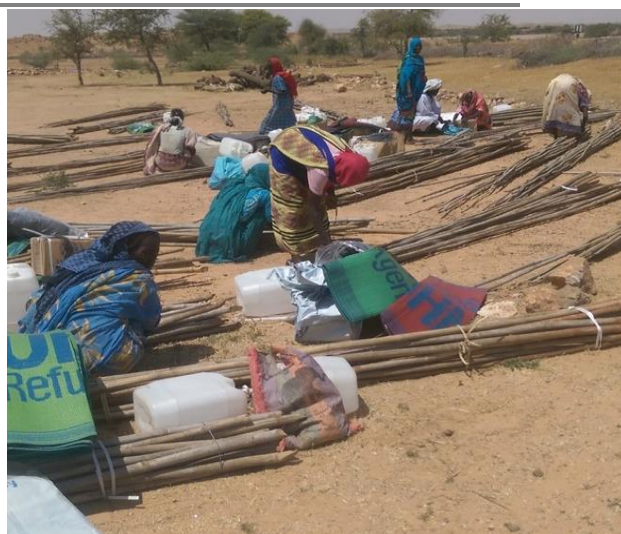
DISTRIBUTION OF NFI CP ITEMS AND EMERGENCY SHELTER MATERIAL TO VULNERABLE RETURNEES IN UM BARRU LOCALITY

PODR: completed distribution of basic emergency shelter material (SHF) together with ES/NFI Kits (NFI CP) to 2482 households, of which 1986 were female-headed.