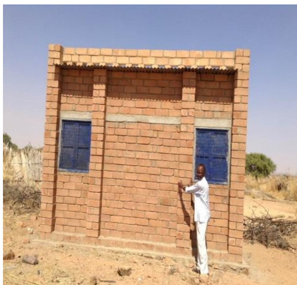
Completed SSB shelter in Angime, West Darfur

UPO completed the construction of SSB shelters for 24 households in Um Baro, North Darfur, out of the targeted 100 in Karnoi town, Garsilba and Gitat.