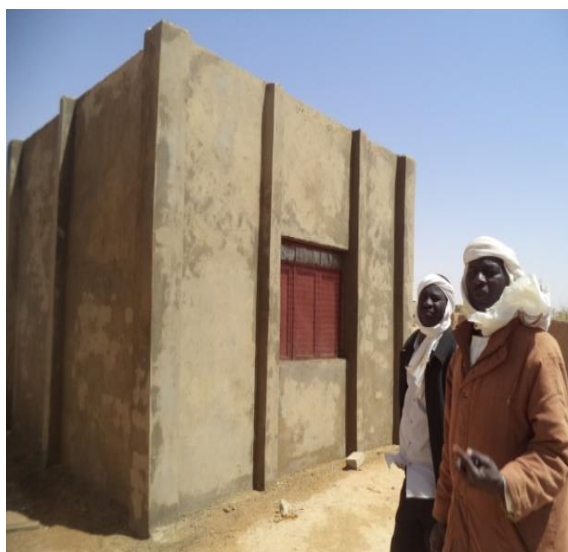
Completed SSB shelter in Kornoi, North Darfur

The remaining shelters will be completed by the end of April. An evaluation of these activities will be undertaken with beneficiary focus group discussions and post implementation monitoring to advise the expansion of the project once additional funding is secured.