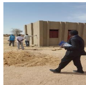
UNHCR/UPO shelter in North Darfur

UNHCR with UNDP and AHA completed a monitoring and evaluation mission to Kornoi locality to assess the transitional shelter project for 100 SSB shelters implemented by UPO. The project covered three locations (Kornoi Town: 60 shelters; Garselba: 25 shelters and Gatat: 15 shelters). The beneficiaries were very shelters were are already now occupied by the. The SSB machines have been left with the communities.