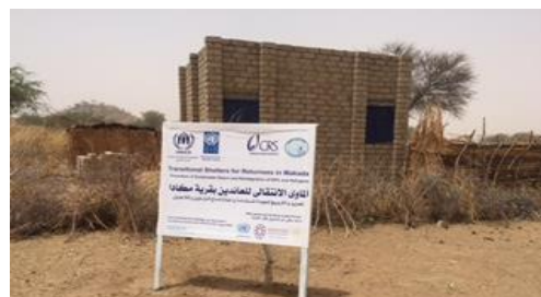
UNHCR/CRS shelter in West Darfur

IOM is constructing 400 transitional shelters for vulnerable returnee households in seven returns villages in the localities of Beida, El Geneina and Sirba. The construction of 43 shelters in Hashaba has been completed, and the construction of 187 shelters is ongoing in Farita, and Majmari return villages. Assessments are ongoing for the selection of beneficiaries in other locations.