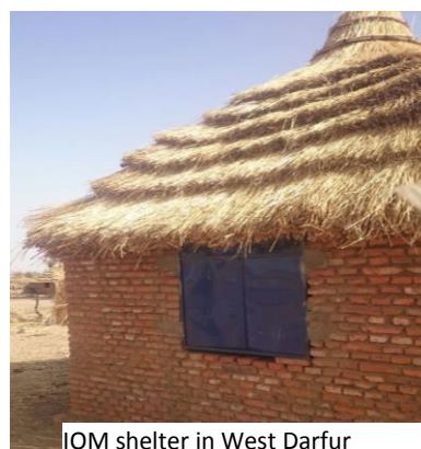
IOM shelter in West Darfur