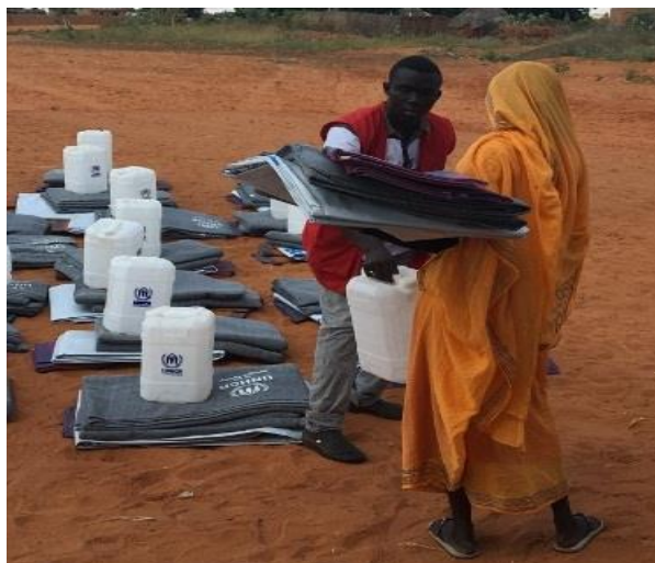
NFIs Distribution to IDPs in South Darfur