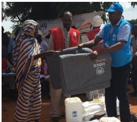
NFI distributions in AllahKareem, Kordofan