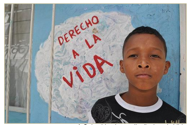
A Colombian internally displaced child (Save the Children, November 30, 2012).

Colombia is a country of paradoxes. While the number of IDPs has increased from 2 million in 2004 to over 6 million in 2014 (and currently ranks second only to Syria in the scale of displacement), the government has taken impressive steps not only to address the needs of IDPs but to bring an end to the long conflict with guerrilla groups. The government has developed perhaps the world's most comprehensive legal system for IDPs, the constitutional court has played an impressively assertive role in protecting IDPs and civil society organizations in Colombia are among the world's strongest. However, there are parts