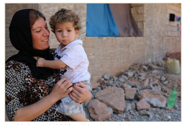
Mother and child from Mosul at a displacement site in Koysinjaq, Iraq.

monitoring, and deliberately false or inaccurate reporting about program results. Discussion of these operational compromises is sensitive but necessary, particularly in light of the review of UN operations in Sri Lanka, in order to ensure accountability for the humanitarian decisions and compromises being made to continue operations. There is a fundamental tension between the "humanitarian imperative" on the one hand and "humanitarian standards" on the other which was particularly highlighted in the case study on Somalia, but certainly applies more broadly. Given the difficulties of carrying out