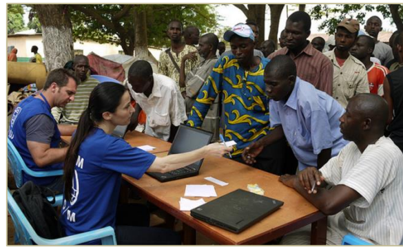
Representatives from the International Organization for Migration conduct registration for IDPs at in Bangui, CAR.

Counting IDPs and assessing their needs and capacities is an inherently difficult task, particularly in urban settings where even identifying IDPs is a challenging undertaking. But the lack of accurate data – on numbers, demographic characteristics, needs and intentions – limits the ability of governments and international responders to tailor suitable programs for them. It also limits our understanding of displacement trends and dynamics. This study has found, for example, that it is impossible to assess whether IDPs are better off through comparison of objective indicators over a