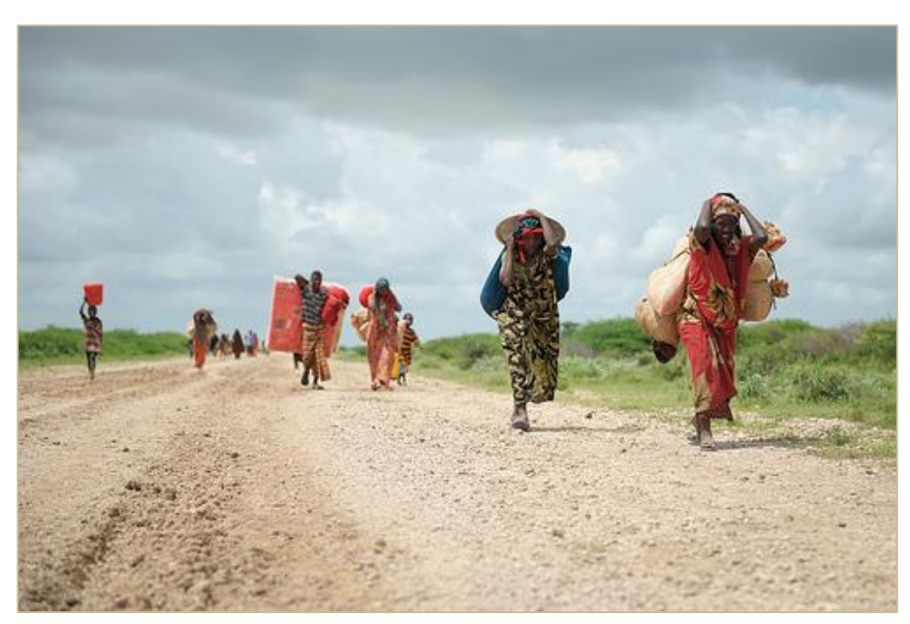
Carrying whatever possessions they can, women arrive in a steady trickle at a camp for IDPs established next to a base of the African Union Mission for Somalia near Jowhar (UN Photo, Tobin Jones, November 12, 2013).