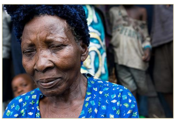
An IDP woman at a camp in North Kivu Province, DRC (UN Photo, Marie Frechon, February 16, 2008).

Although there is now much greater awareness of protection than when Protect or Neglect was published, there are signs that internal displacement is slipping off the international agenda. There is a danger of losing progress made on IDPs over the past two decades. The trend toward mainstreaming, the decreasing visibility of IDPs on the international agenda, the decline in numbers of staff focusing explicitly on IDPs in international organizations such as UNHCR, OCHA, and ICRC and the weakening of the position of Special