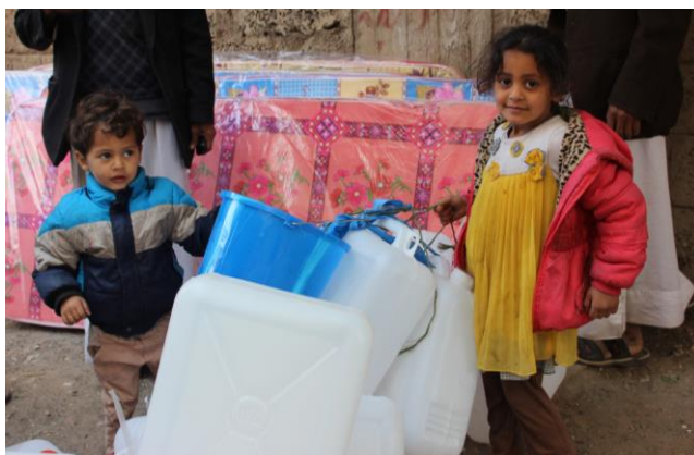
© Distribution of NFIs in Amanat AlAsimah, ZOAN/NFDHR/LMPO, 2015.