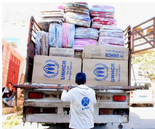
© Transportation of NFIs in Ibb, UNHCR/ACTED, 2015.