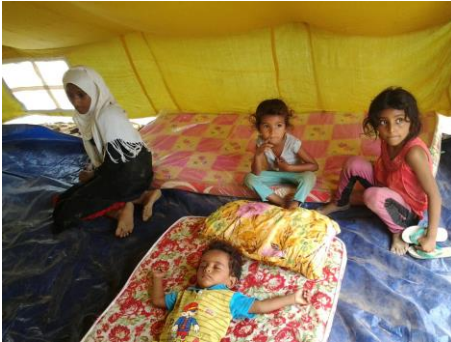
A family received Non-Food Items at tent in Az Zuhrah district, Al Hudaydah Governorate. April 2016.