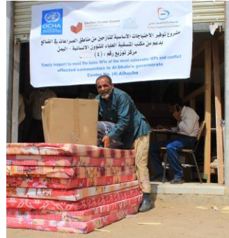
Distribution of Non-Food Items kits in AIdhale'e Governorate. © Salah A./ Wethaq | March 2016.