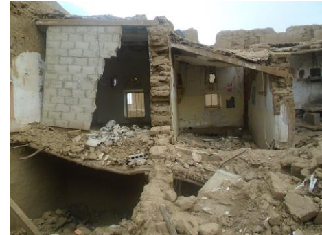
Houses destroyed by the recent floods in Shararah area, Amran Governorate April 2016.