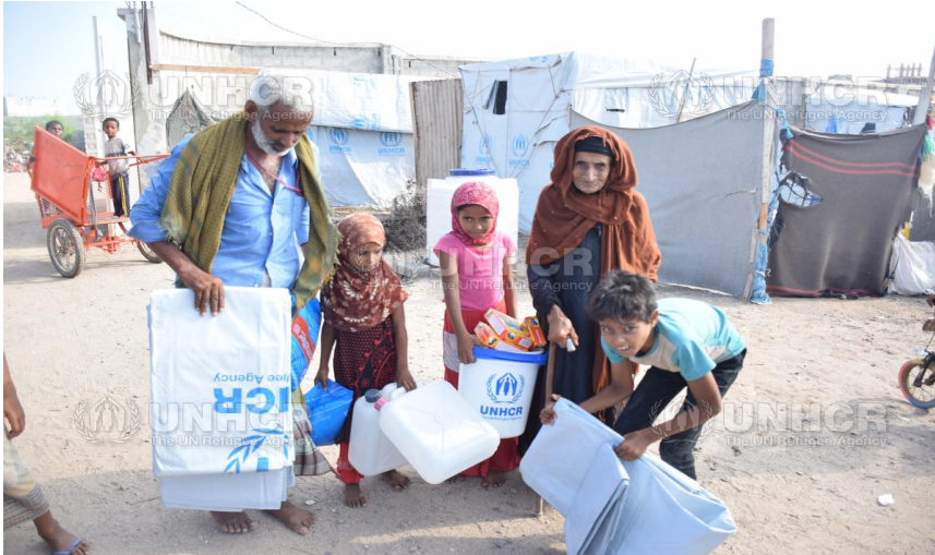
Displaced family receives a non-food items kit provided by UNHCR in Aden governorate.