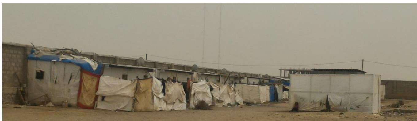
IDPs hosting site in Aden Governorate. July 2017